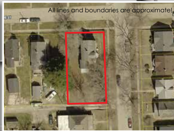
All lines and boundaries are approximate.